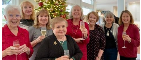
Chatty Critics Book Club at their Christmas Potluck Lunch