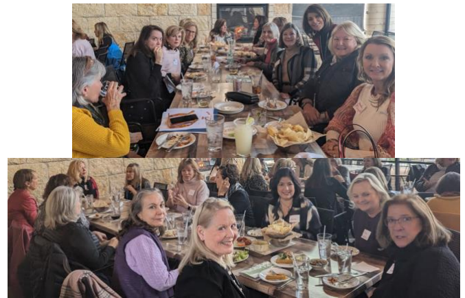
New Member Event at the Canyon Grille