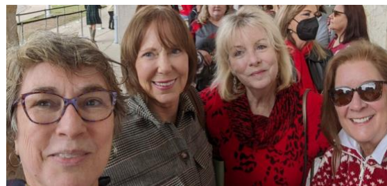
An enjoyable Out and About excursion to the Junior League Christmas Affair at the Palmer Events Center