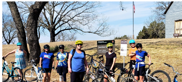
Bicycling around the LBJ Ranch – March 3, 2022. See all our LBJ Ranch ride photos at: https://link.shutterstock.com/ugBM5Aimnob